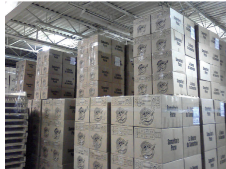
Boxes of Shoe boxes ready to go!